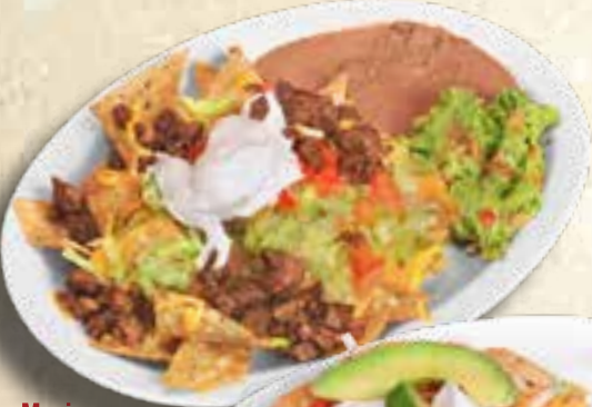
Mexican Nachos With Meat